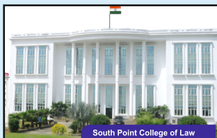
South Point College of Law

B.A.LL.B. (Hons.) • LL.B. (Hons.) • LL.M.