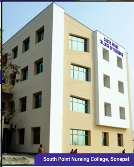
South Point Nursing College, Sonapat