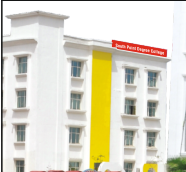
South Point Degree College