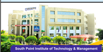
South Point Institute of Technology & Management