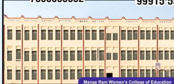
Mange Ram Women's College of Education