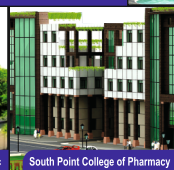
South Point College of Pharmacy