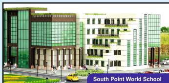
South Point World School