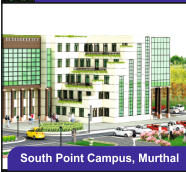
South Point Campus, Murthal