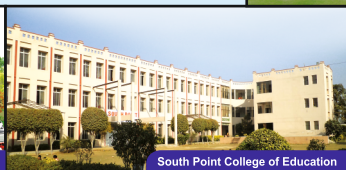
South Point College of Education