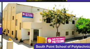
South Point School of Polytechnic